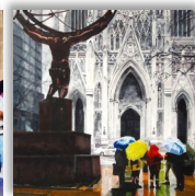
30 Rock III