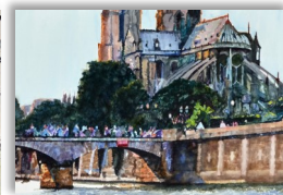
Evening Light ND